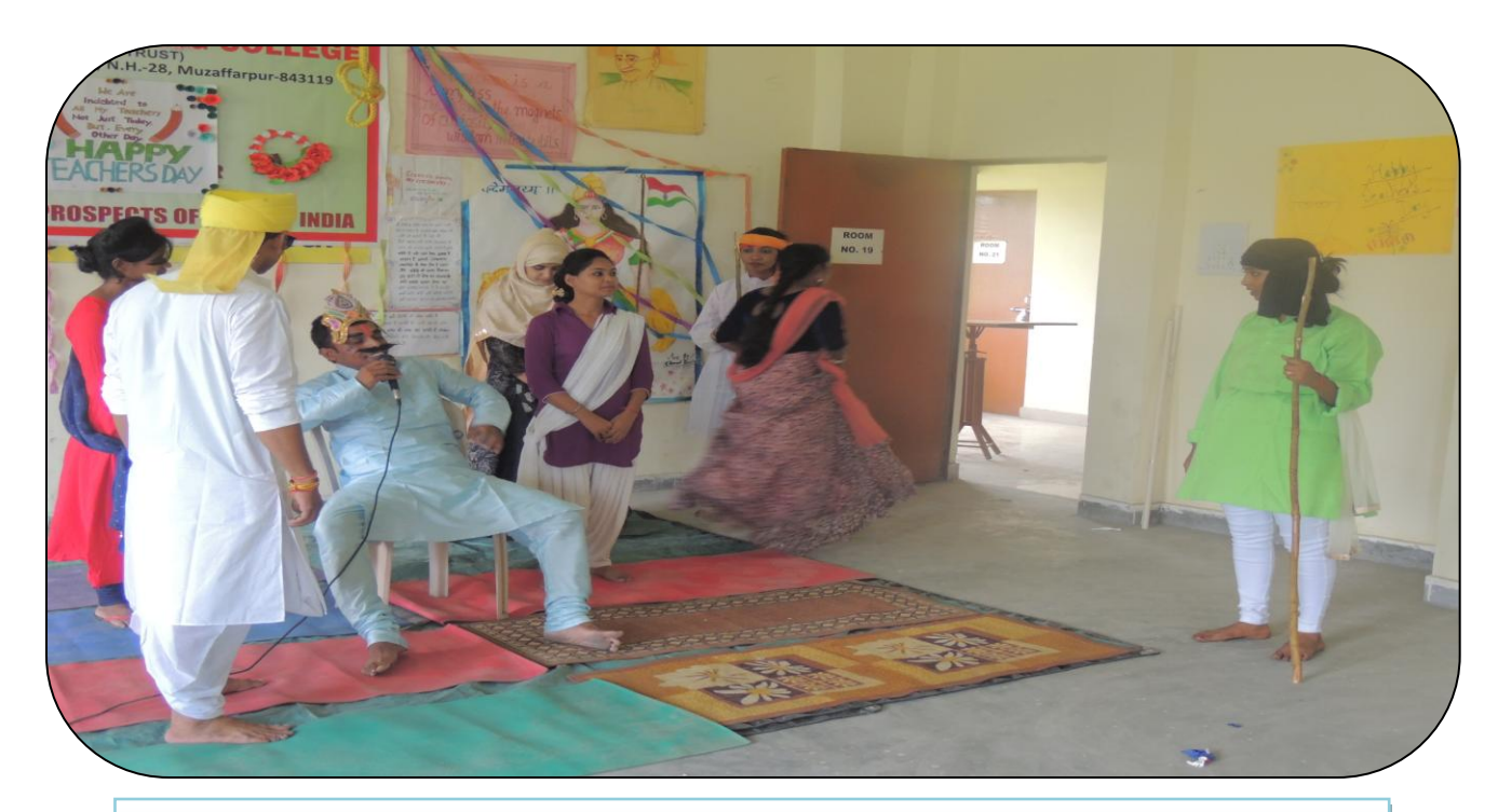
Students performing Natak "Andher Nagri Chaupat Raja" 15th Aug - 2022

On the suspicious occasion a drama competition was organised which was also performed by four groups of students with different houses the audience enjoyed the Natak a lot which create laughter and lighten the atmosphere after emotional patriatic song sung by the group of students. In this Natak competition AZAD HOUSE won the competition and awarded certificate and prize.