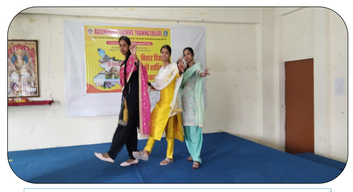
Students performing dance at 22/03/2022

The Bihar Diwas cultural dance competition was a resounding success, celebrating the rich traditions and cultural heritage of Bihar. The event provided a platform for young talents to shine and encouraged the preservation of traditional dance forms. The organizers look forward to continuing this tradition, making Bihar Diwas an even more grand and culturally enriching celebration in the coming years.