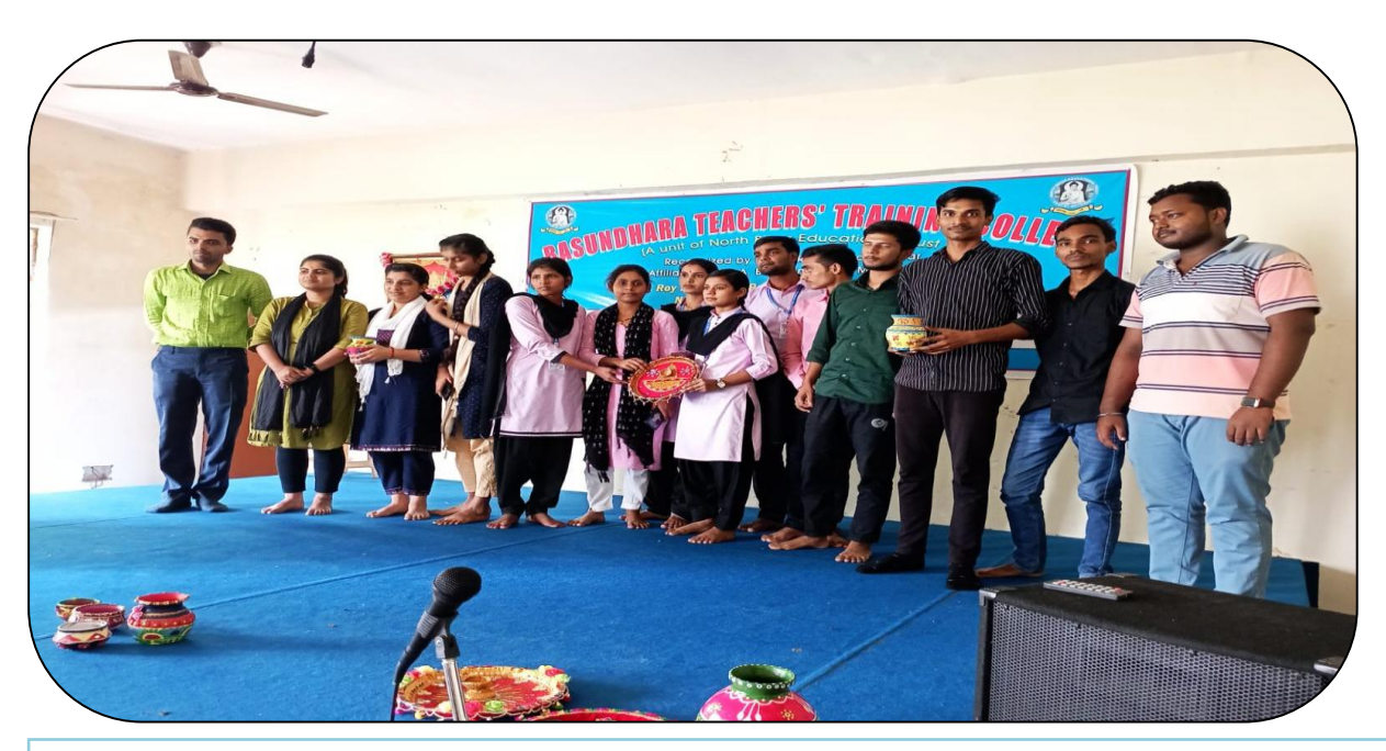
Students having photo with their pots 15<sup>th</sup> Aug - 2022

Program begins at 10:00 AM and worthy chairman on full meld the national flag administered loud cheers.