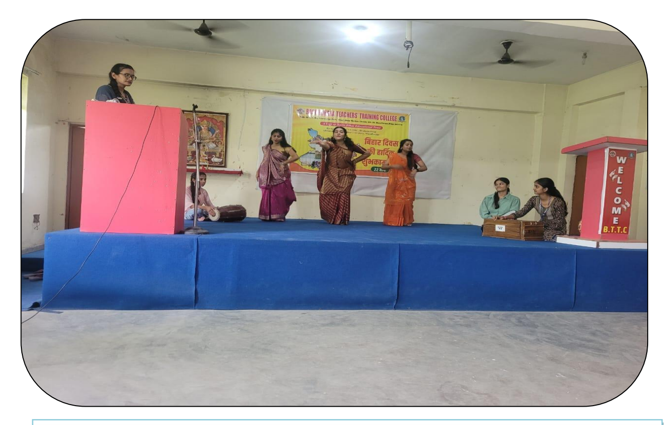
Students performing cultural dance in multipurpose hall 22/03/2022

The participants delivered captivating performances, with notable mentions including: